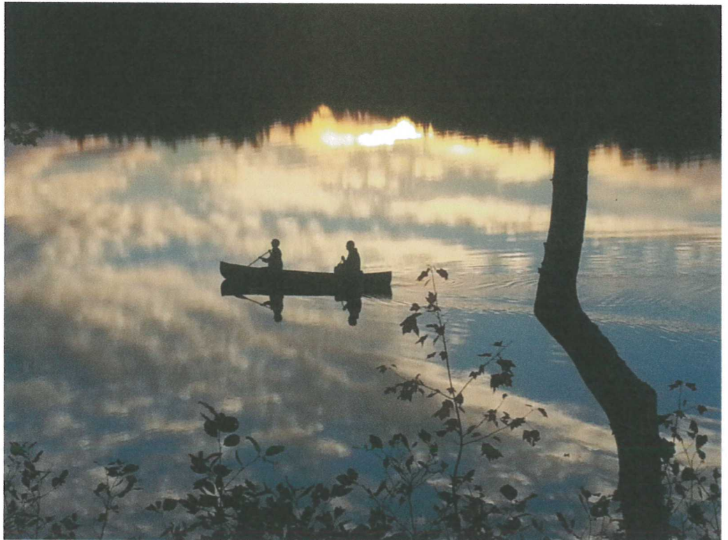
“Paddling in the Clouds”