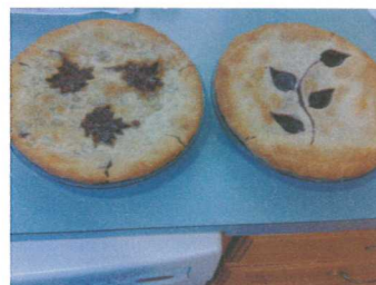
Pies for Prize