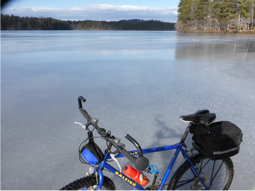
while riding the lake perimeter on his bike to check the ice conditions.