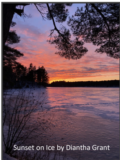
Sunset on Ice by Diantha Grant